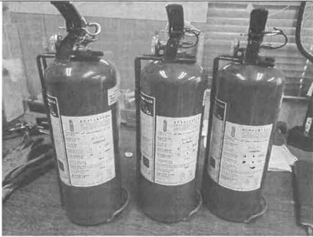
Three Fire Extinguishers