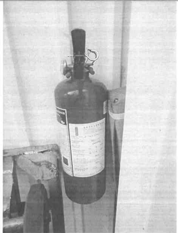
At Carpark Area